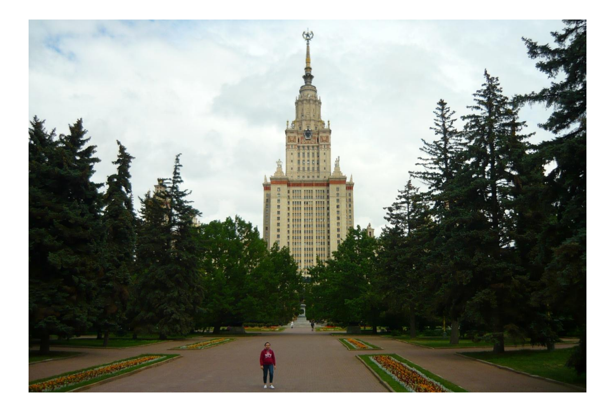
Main building of the Lomonosov Moscow State University (2023)